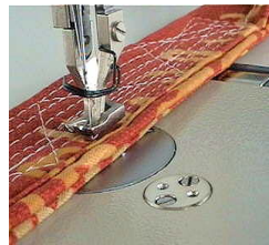
15mm Foot lift height