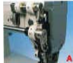
Up to 8mm stitch size